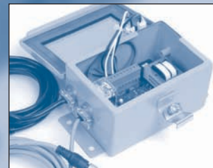
Employing the latest in pneumatic control technology and electronic circuitry